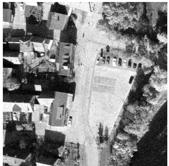
Figure 4: RMK image (scanned at 15 \mu\text{m} resolution, flying height 2000 m, GSD 20 cm)