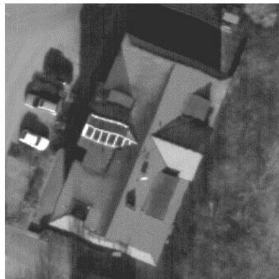
Figure 6 Rectification, Applanix exterior orientation.