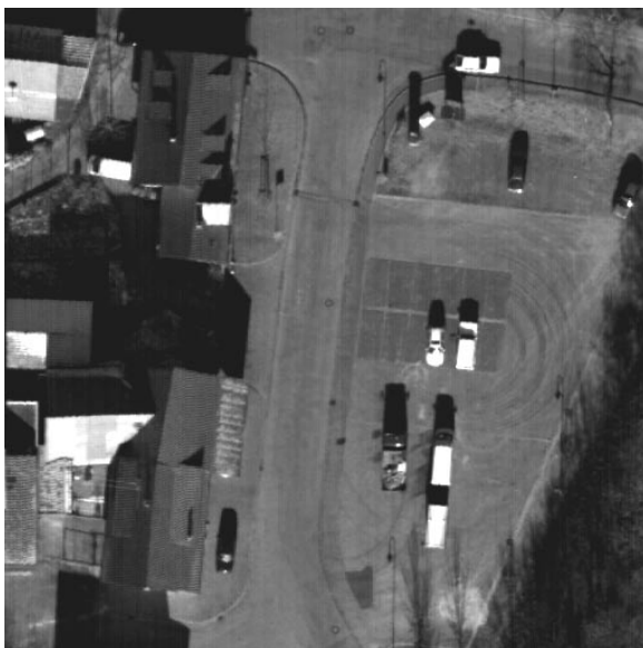
Figure 3: HRSC image (flying height 3000 m, GSD 12 cm)