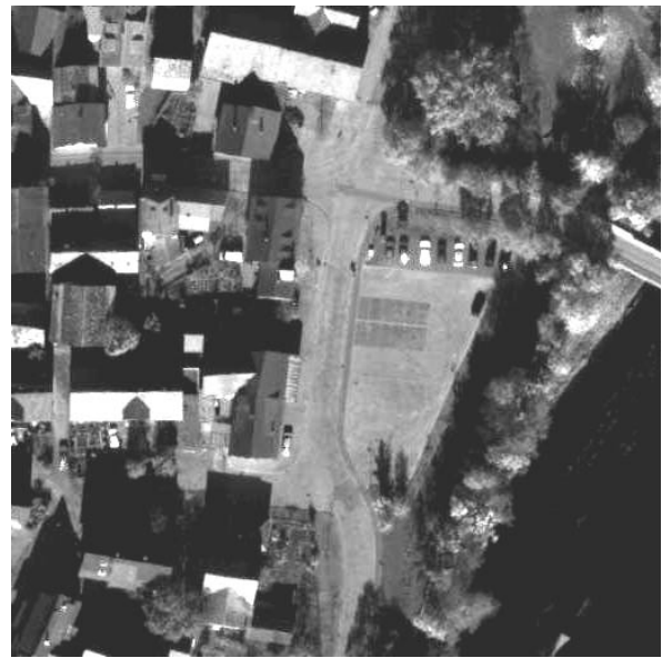
Figure 2: DPA image (flying height 2000 m, GSD 25 cm)