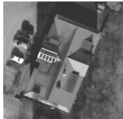
Figure 7 Rectification, ifp exterior orientation.

Using the PosProc orientation parameters, object points could be determined with an accuracy better than one pixel. This can be seen from the estimated \sigma_0 a posteriori value after adjustment which is below one pixel in image scale. This high accuracy is transferred to the accuracy of object point determination on the ground. The RMS values are about 10cm for the east component, which corresponds to the flight direction (ground pixel size 17cm) and about 5cm for the north component, perpendicular to the flight direction (ground pixel size 12cm). The maximum deviations did not exceed 30cm for the east, 10cm for the north, and 30cm for the vertical coordinate. Compared to the results from the PosProc orientations, the accuracies of the ifp strip-wise approach given in Table 3 are slightly worse. This is mainly caused by the fact that for this test the unfiltered inertial data are used for the determination of the exterior orientation. This introduces noise on the attitude data and results in larger maximum errors in object space. Therefore, the maximum deviations obtained for the exterior orientations from the ifp approach are about 50cm for the east, 20cm for the north and 50cm for the vertical coordinates, the RMS values are about 20cm for the flight direction, 10cm perpendicular to the flight and 20 cm for the height component. The differences between the attitudes from the combined AT to the val-