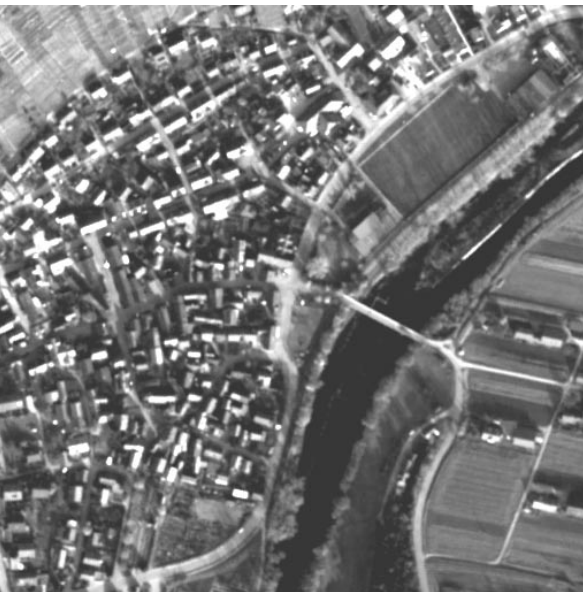
Figure 1: WAAC image (flying height 3000 m, GSD 1m)